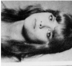
AGNES BRUCKNER FROM HER HIGH SCHOOL YEARBOOK. IN SHE CALLED HERSELF NICOLE MARSH

Lifetime TV network released The Anna Nicole Story , with Agnes Bruckner starring as the troubled pin-up and Martin Landau portraying J. Howard Marshall.